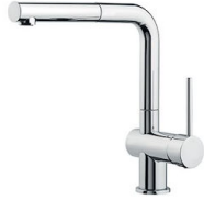
Mixer Tap Gamma 8483 001