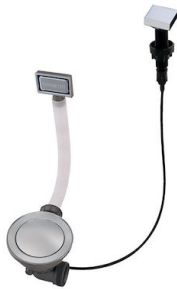
Space automatic waste fitting - PA 8407 108