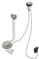
Space Light automatic waste fitting - PL 8407 117